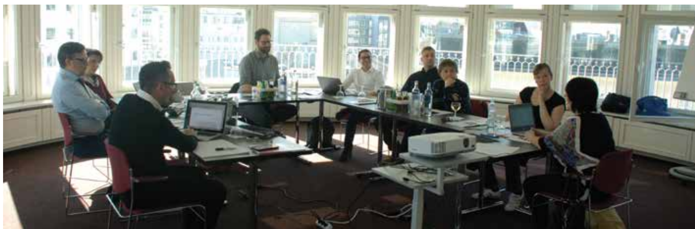
Participants at the Berlin preparatory phase meeting, 27 March 2017

and competences can contribute to a deeper and more effective understanding of the burden of the disease and improve patients' daily life.