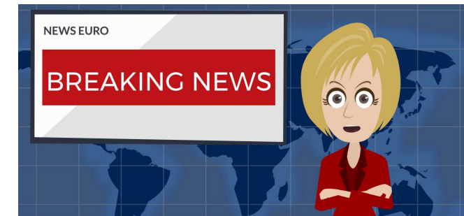
The European Medicines Agency (EMA) has just granted approval for a new drug to treat Ulcerative Colitis.

The European Medicines Agency (EMA) has granted approval for a new drug to treat Ulcerative Colitis. As soon as this news is received, the DIVA platform is promptly notified and sends an alert to all members of EFCCA (who have been previously registered upon request by the EFCCA Secretariat). This ensures that they are kept up-to-date on the latest developments and can take action to promote the approval of the drug in their respective countries. By staying informed, the patient associations can work towards accelerating the availability of this new treatment option for those affected by IBD.